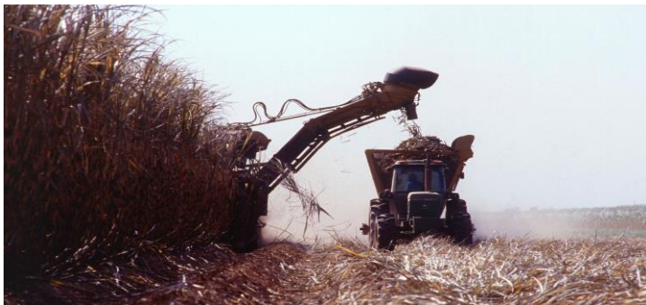
"Have a Safe and Blessed Harvest Season."