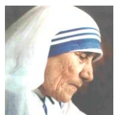
Saint Mother Teresa

Lafayette Vocations - www.facebook.com/lafayettelavocations and website www.lafayettevocations.org